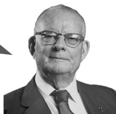
W. Edwards Deming*

"It is not necessary to change. Survival is not mandatory."